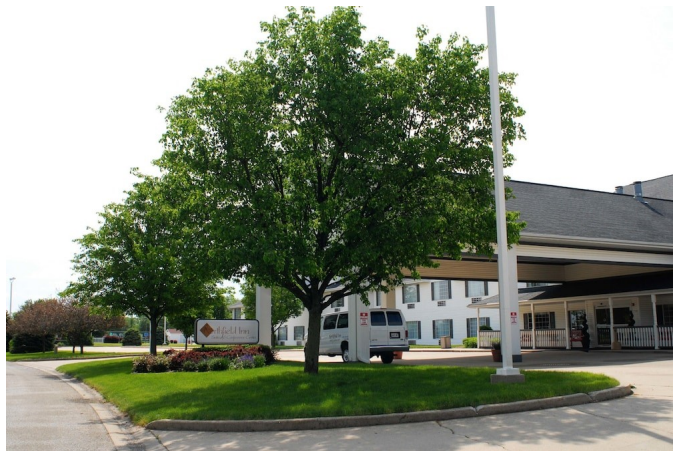
NORTHFIELD INN AND SUITES SPRINGFIELD, ILLINOIS

This years reunion will be in Springfield, Illinois September 27-30. The airport name is Abraham Lincoln Capital Airport. Our hotel is the Northfield Inn & Suites, located at 3280 Northfield Dr., Springfield, IL 62702. The hotel offers free shuttle service to and from the airport. We recommend you make your airline reservations as early as possible to take advantage of lower price's. American, United and Allegiant fly in and out of the airport. Chicago and St Louis are a four hour drive from Springfield.