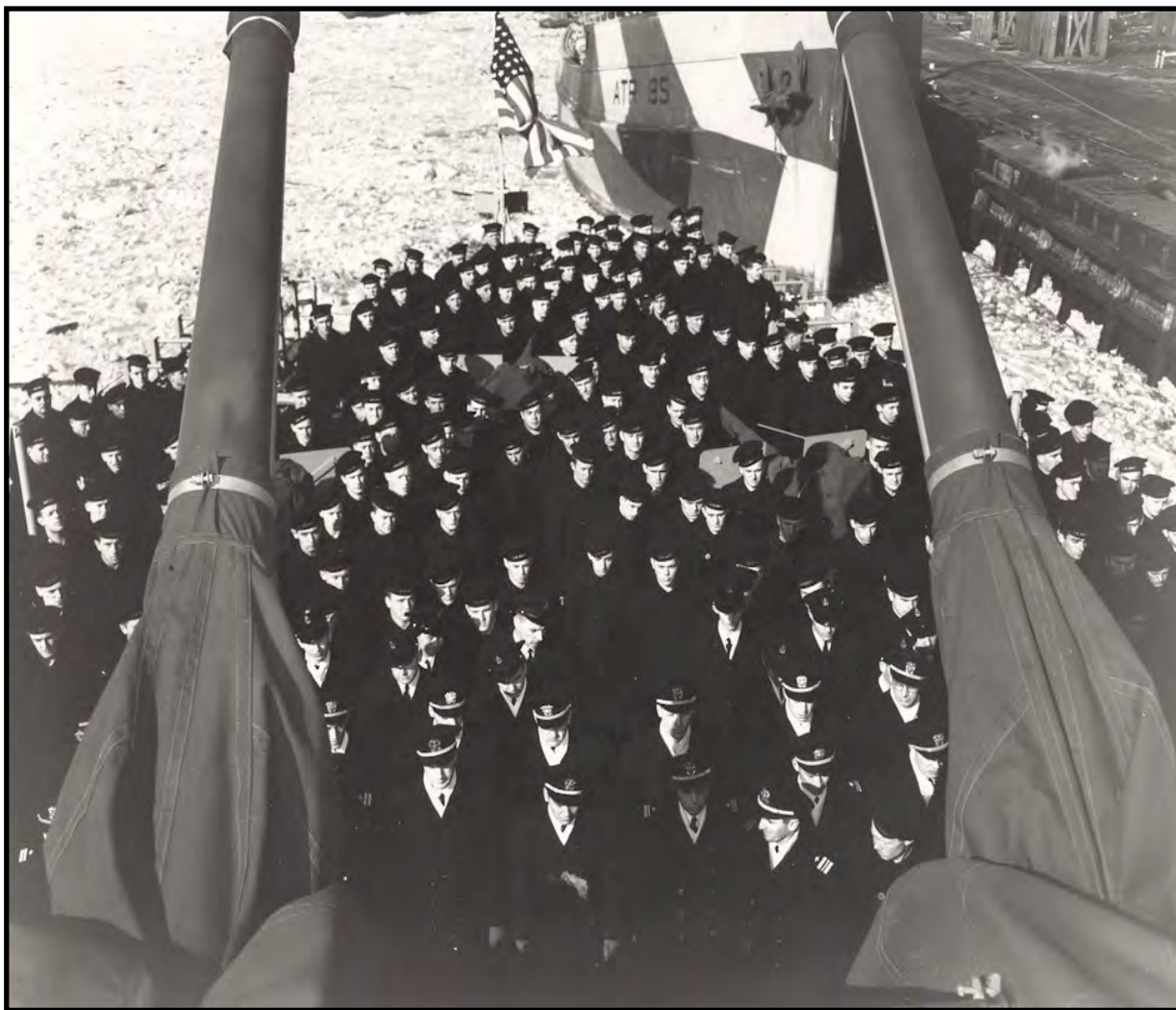
Photo: February 3 1945, Commissioning Day.