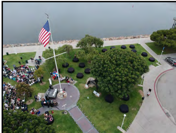
Approximately 350 were in attendance for the 3 June Memorial Ceremony, largest memorial ceremony to date. The Memorial Ceremony for the fallen 74 is held every year on 3 June at 10 a.m. in the Navy Memorial Park, Long Beach.